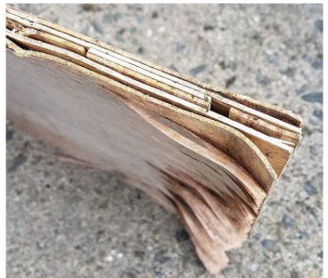
Example 2: Badly delaminated plywood – unsuitable for any end use.