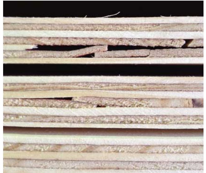
Example 1: Gaps and over-lap defects in core veneers of plywood.

Some common defects of plywood are shown below in examples 1 and 2.