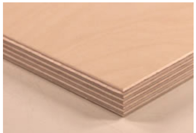
Example 3: Good quality plywood.