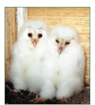
Barn owl chicks in nest box.

Artificial nest-platforms can also be provided for tree-nesting merlins, but British experience suggests that such platforms are usually unnecessary, given the natural availability of crow and magpie nests. More ambitiously, provision of artificial nest bases for ospreys in old conifers (e.g. lakeside Scots pines) may play a role in the hoped-for colonisation of Ireland from Scotland