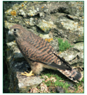
Young kestrel on an old wall.

Within or immediately adjacent to a new forest, other habitats can contribute to avian diversity. On agricultural land, planted for forestry, remnants of field boundaries or even buildings, e.g. raised ditches or walls, may provide nesting habitat for birds such as blue tit and wren. Ponds or marshy areas, if left undrained and unplanted, may support additional species of bird within a forest (even at the compartment level), and also provide valuable habitat for amphibians and insects. Retention of adjacent hedgerows or scrub (low forest) will increase connectivity to the surrounding countryside. These habitats in themselves may support bird species that might otherwise only use the forest itself over part of its rotation or for foraging. Adequate unplanted zones between forests and non-forest features may also be important, e.g. to prevent excessive shading of ponds.