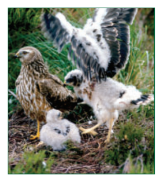
Hen harriers at nest.

Long-term availability of young regenerated forest (maintained through staggered felling and replanting on a landscape scale in the order of 200 ha) is likely to be value to harriers for hunting, provided that adequate areas of ungrazed, unafforested moorland are available as nesting habitat nearby.