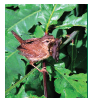
Wren with nesting material.