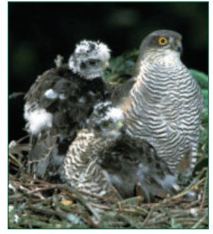
Sparrowhawk at nest.