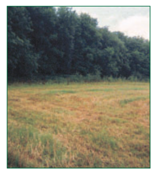
Typical forest edge bordering farmland.

Forest edges commonly fall into three basic types: