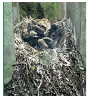
Raven nestlings in an old castle.