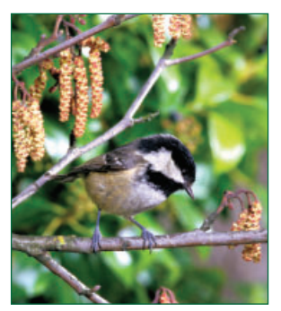
Coal tit among catkins.

Many first rotation coniferous plantations in Ireland are dominated by Sitka spruce and lodgepole pine, species which were considered likely to grow well on 'virgin' sites of uncertain productivity. It is now clear that some sites are capable of supporting more demanding species (e.g. Norway spruce).