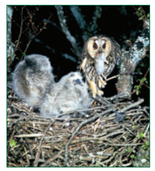
Long-eared owls at nest.

Non-forest cover is particularly important for bird species characteristic of open habitats, e.g. breeding waders in the uplands. However, some species that nest (or can nest) in coniferous plantations also require open habitats for foraging. Examples include sparrowhawk, merlin, long-eared owl and raven. Where the forest area is extensive, such species may nest only around the edges, or in individual small blocks, and forage in surrounding habitats. Open habitat will also benefit other animals and plant groups. Further research aimed at quantifying the value of open areas, at various scales, may lead to further suggestions for mandatory targets for open areas.