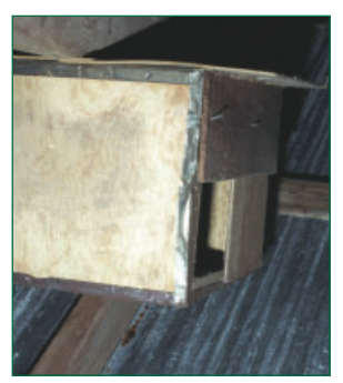
Barn owl nest box.

Du'Feu (1993) notes that wood is the best material for making nestboxes, but can be expensive. He recommends that the dimensions of nestboxes are generally not critical and it is easier, cheaper and more effective to make boxes according to wood available rather than to adhere slavishly to precise dimensions.