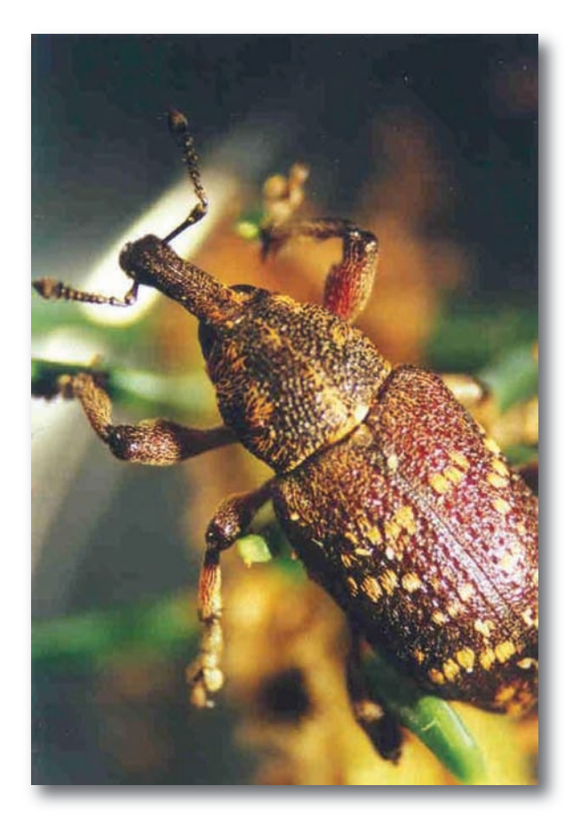
The large pine weevil, Hylobius abietis.