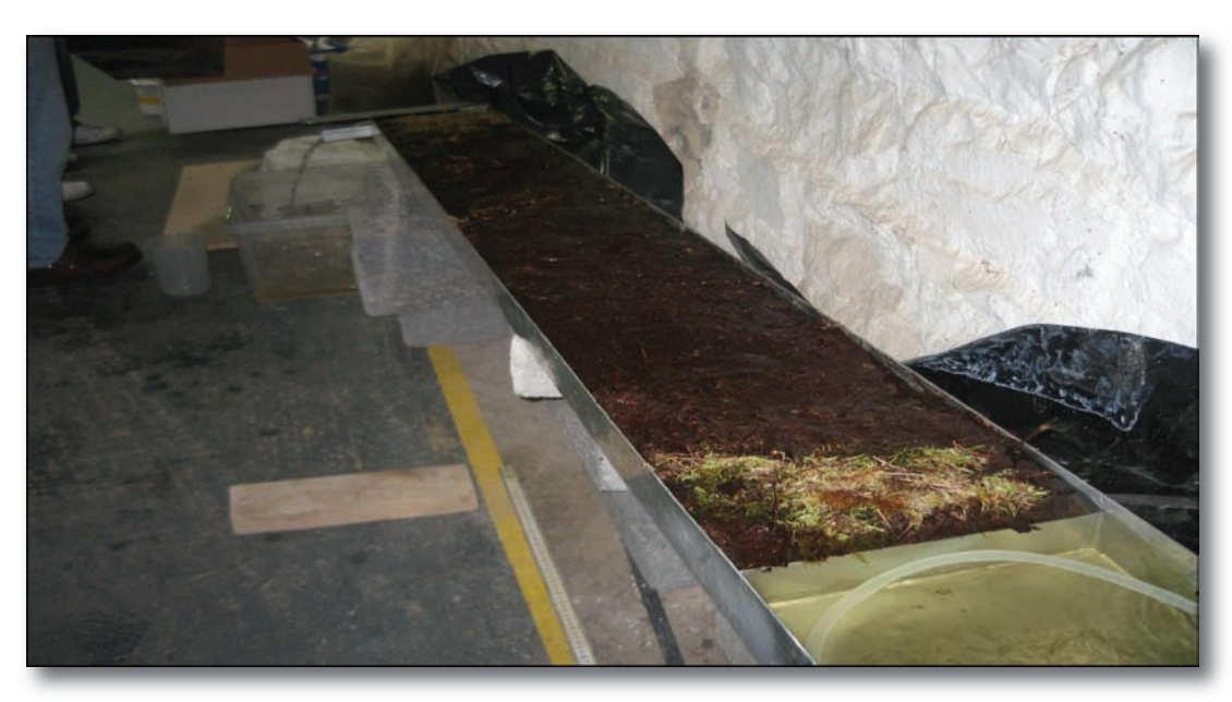
Figure 1: The flume testing.

A steel flume, 225 mm deep x 225 mm wide and 3 m long (Figure 1), is used in this study to simulate the overland flow process and to compare the effects of flow rate, slope and disturbance on the erosion of the Irish forest soils. Slabs of peat, of depth 200 mm, were excavated carefully with minimal disturbance from between the brash windrows at the Burrishoole study site, and placed directly into the flume. After saturation for 24 hours, tap water was pumped to a small reservoir at the head of the flume and from there it passed over a flat weir, the crest of which was 10 mm above the surface of the soil slab. The weir ensured an even distribution of the flow over the width of the sample. Runoff samples from the exit of the flume were taken every two to four minutes during a one-hour