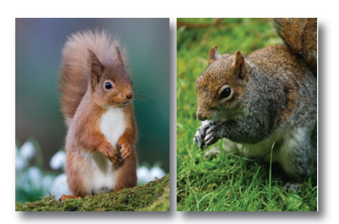
left: Native red squirrel ( Sciurus vulgaris ). right: Alien grey squirrel ( Sciurus carolinensis ).

• To promote red squirrel conservation and educate people on the threat posed by the grey through directly involving the general public with the survey.